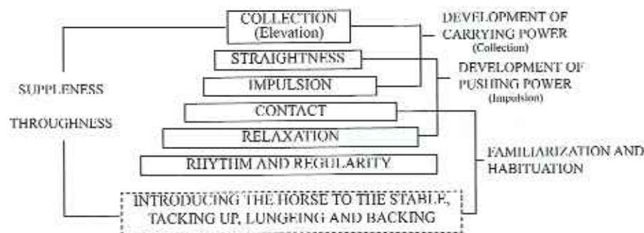
THE TRAINING SCALE or "pyramid of training"

that each gait can help improve the others and that exercises done in one gait can, in the long run, help improve the other gaits.