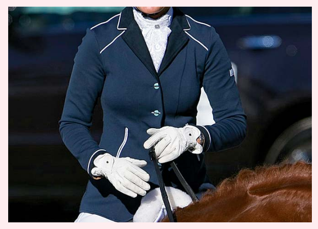
Dark-blue short jacket with military-inspired shoulder piping, dark lapels, and aqua buttons