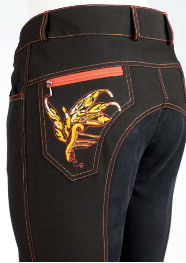
NO MORE BORING BREECHES: Fashion-forward riders have embraced these colorful, sequin-adorned breeches from Huntley Equestrian

riders in "Welly World" for schooling. Hall foresees grays and plums as the next hot colors (and predicts a void is just waiting to be filled by "a great brown breech").