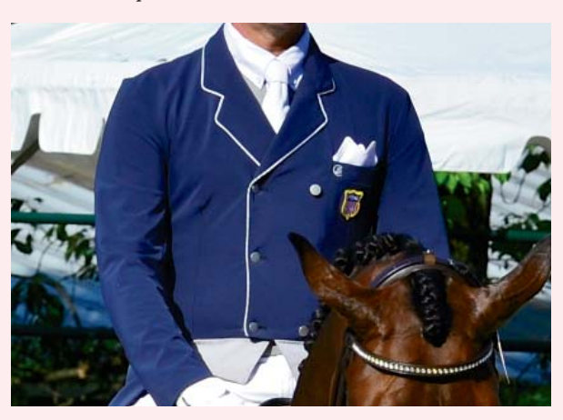
White piping and silver vest points on a not-quite-royal-blue shadbelly