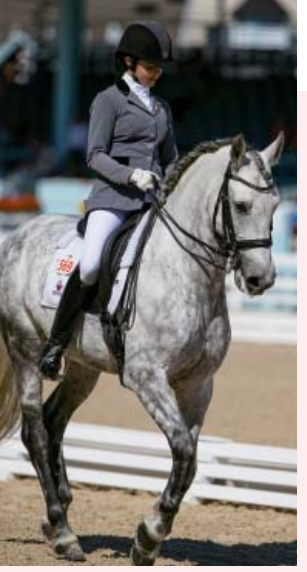
UNDERSTATED ELEGANCE: Eye-catching dapple-gray horse is complemented by his rider's gray-and-black ensemble, with her blue jacket buttons providing a hint of color

Bay/chestnut : Cool jewel tones, like blue or teal, add accent. Avoid reds.