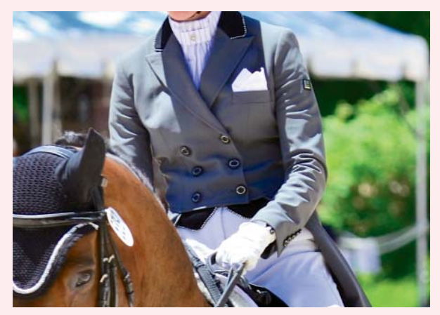
Gray shadbelly with "bling" buttons and black crystal-edged collar and vest points

So what are riders wearing these days when they enter at A? Here's a sampling of outfits that caught our eye.