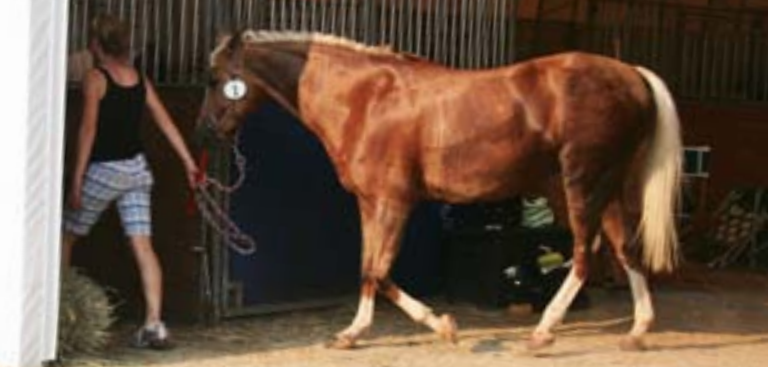
HORSE ID: Horses must wear their competitor numbers at all times when out of the stall