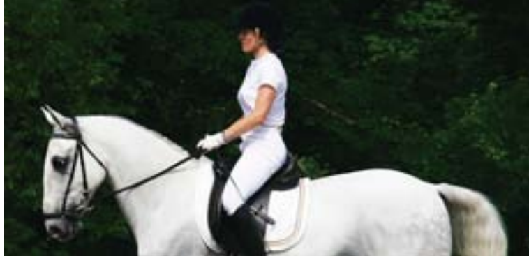
LOSE THE NECKWEAR: When jackets are waived in hot weather, remove your stock tie

horse treats containing red food coloring, which can tint his saliva red and be mistaken for blood.)