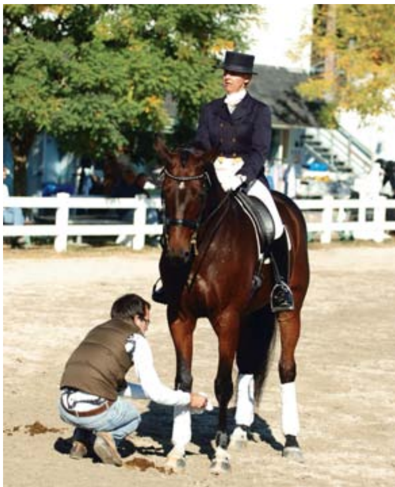
OFF WITH THE WRAPS: Enlist a helper to remove them if you're likely to forget