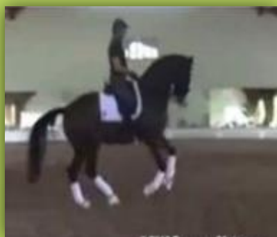
IMPROVING THE WORKING PIROUETTE #1663