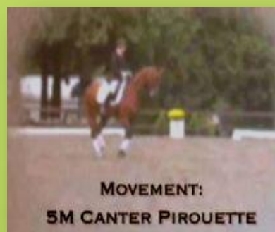
DIRECTIVES AND SCORES #1436